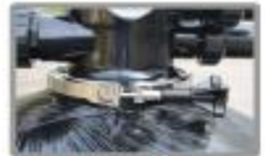
Stainless steel clamp valve