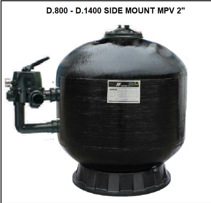
D.800 - D.1400 SIDE MOUNT MPV 2"